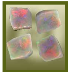
Four views of the same fabulous Opal from the famous Lightning Ridge field in Australia, exhibiting strong rolling red flash and unique swirling patterns. Currently in Jewels by Design's stock

During the Medieval period the change of colour intensity was viewed to predict good or ill health, Australian legend gives a large opal the power to govern the stars and guide human love, The aborigines, however, see the opal deposits that 'lurk in the ground' as half-serpent, half-human and view it with superstitious awe.