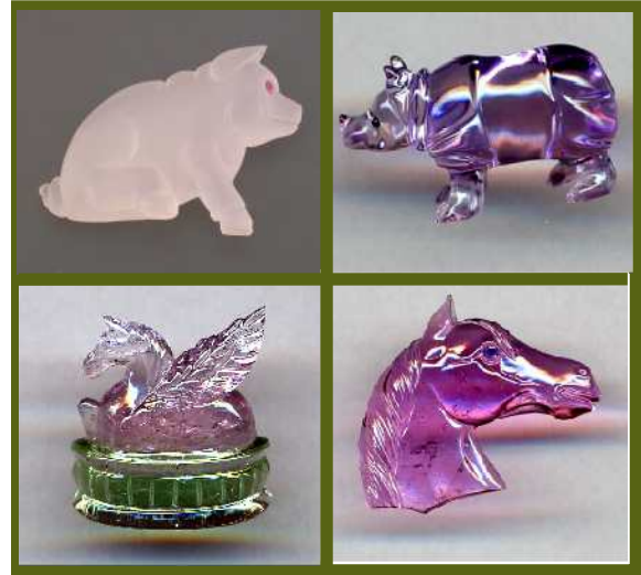
A Crystal Menagerie: