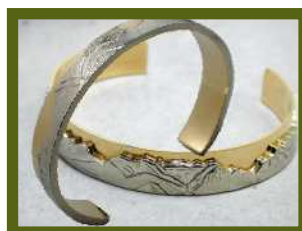
Bangle bracelets, two-tone Gold. Choose your favourite mountain peaks. Also available as pins and rings