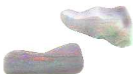
Free-form Boulder Opals with striated patterns