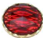
Oval rose-cut Pyrope Garnet from Gustav Caesar set in mirror-back mounting ready to be made into a ring or pin