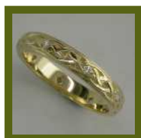
Celtic band with small diamonds bound in the knot-work