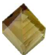
Geometric fantasy cut Citrine by Tom Munsteiner