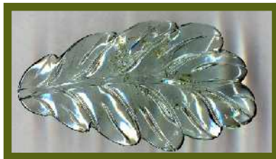
Oak leaf carved from blue-green Tourmaline crystal