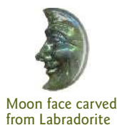
Moon face carved from Labradorite