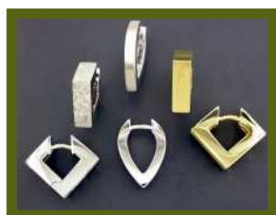
3 pairs of geometric gold earrings 14K karat yellow and white Gold