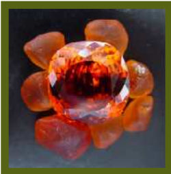
Faceted Mandarin Spessartite Garnet surrounded by uncut crystals