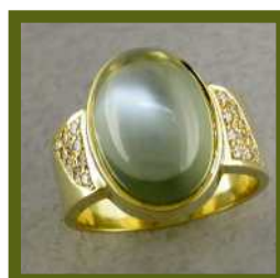
Ring with luscious Green Moonstone accented with Diamonds